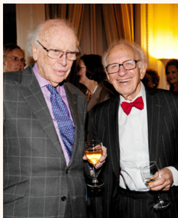
Nobel laureates James Watson and Eric Kandel