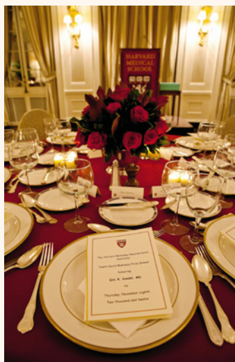
Table setting for the dinner honoring Eric Kandel, recipient of the 10th David Mahoney Prize