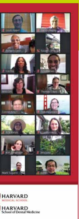
THE CLASS OF 1995 CELEBRATES ITS 25TH REUNION DURING A PRIVATE ZOOM EVENT.

Visit the Reunion recap webpage to see event highlights and videos at alumni.hms.harvard.edu/2020-recap