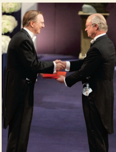
Jack Szostak (left) is the 15th HMS faculty member to win the Nobel Prize.