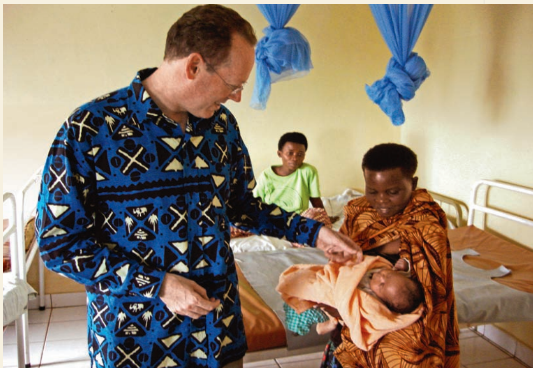
HMS professor Paul Farmer checks in on patients at Rwinkwavu Hospital in Rwanda, run by Partners In Health and the country's Ministry of Health.