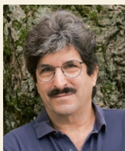
Gary Ruvkun , professor of genetics, MGH: Ruvkun played a pivotal role in the discovery of microRNAs. Currently investigating

number of minority faculty, physicians and scientists in postgraduate medical education at HMS and its 17 affiliated institutions. She has established model programs to develop minority faculty that emphasize mentoring and leadership and that draw outstanding underrepresented minority students into the pipeline.