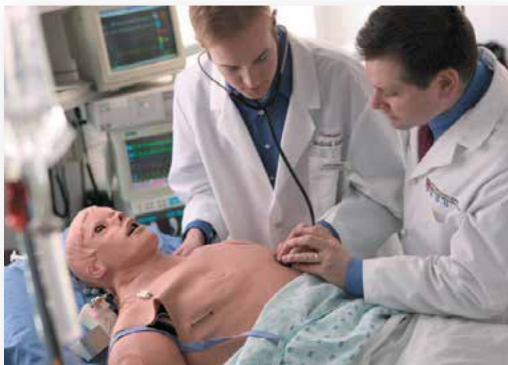
"Stan," a computer-controlled mannequin used as a patient simulator, recreates the clinical experience for students.

For more than a decade, five of the top 10 independent hospitals funded by the National Institutes of Health (NIH) have been Harvard affiliates.