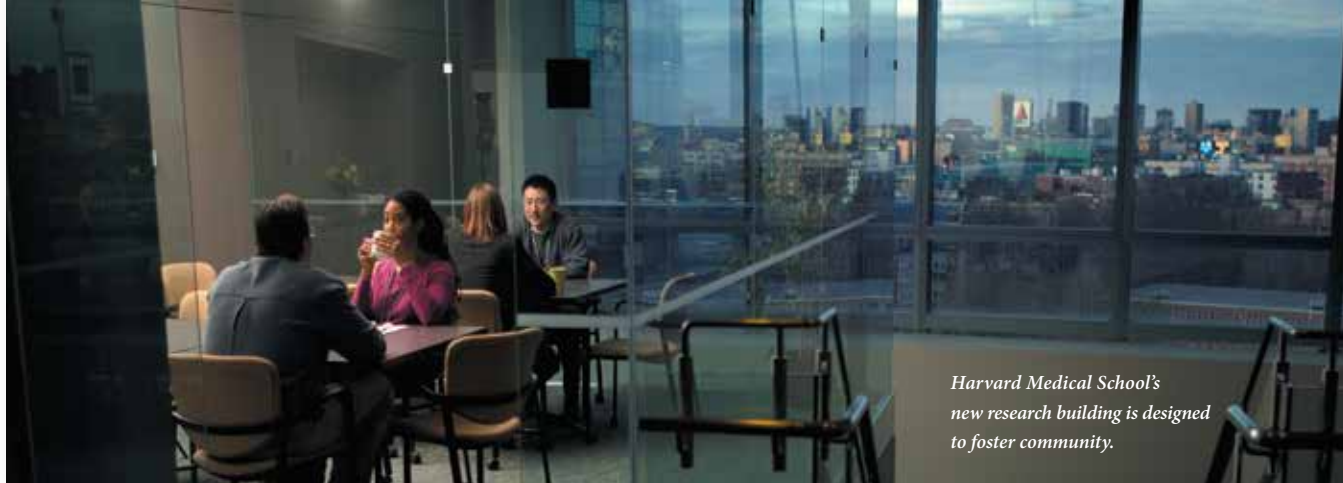
Harvard Medical School's new research building is designed to foster community.